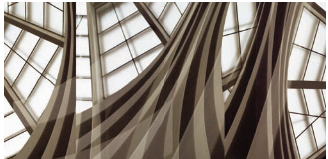
Guggenheim Skylight, New York, 2005. Architect: Frank Lloyd Wright