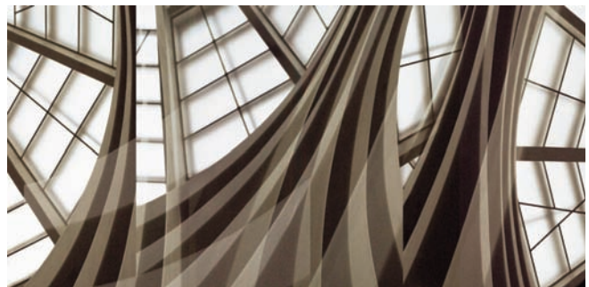
Guggenheim Skylight, New York, 2005. Architect: Frank Lloyd Wright