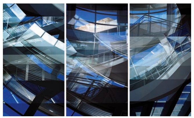
Getty Entrance Triptych, Los Angeles, 1987. Architect: Richard Meier

"Okun is an artist who uses the camera as a compositional and scanning device to capture the poetic essence of a structure without regard for its function. Her interest is not in the architecture itself but rather in the innovative and formal elements from which it is composed. It is this quality that makes her images unique and memorable. Instead of looking at the whole she becomes absorbed in the details: the planes, the angles, the transparencies that serve the building as overhanging eaves, windows, or entryways. The process of invention is to interpret how these elements interact with one another to create a multifaceted organism."