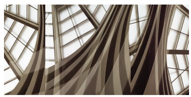
Guggenheim Skylight, New York, 2005. Architect: Frank Lloyd Wright