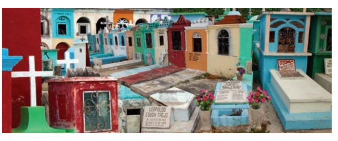
Graveyard, Cancún, Mexico, 2010