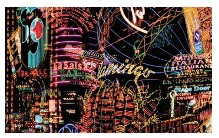
Las Vegas Lights 4 Cantina, Nevada, 2007