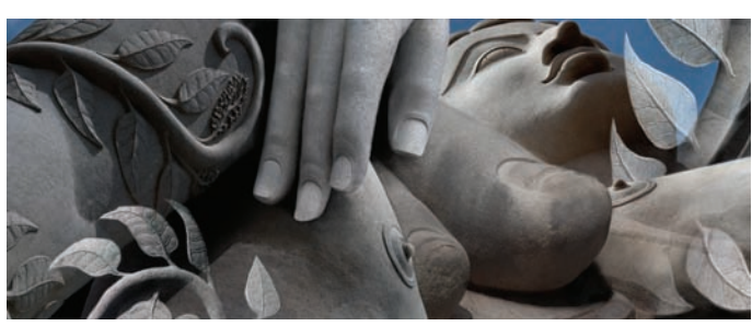
Jain Temple Buddha, India, 2004