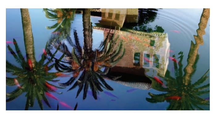
Reflections 4 Alhambra, Granada, Spain, 2006