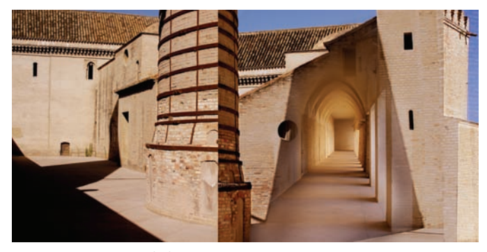
Ceramics Factory 4, Madrid, Spain, 2006

"To enter Jenny Okun's photographic world is to enter a timeless, spatial fantasy where the only limit is the viewer's imagination. The photographs in Dreamscapes reflect travel to ten countries, several American states, and multiple cities, but for Okun the locations are only important in so far as she is able to capture and communicate her subjective memory of experiencing them, of what it felt like to be there. In [her] reimagined scenes and tableaux, Okun seeks to make visible the melodies and emotions that underscore reality."